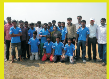
Our 20th Year Celebrations